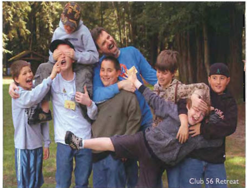
Club 56 Retreat