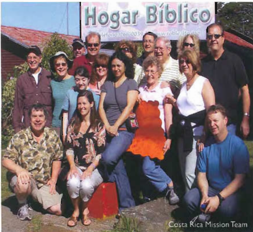
Costa Rica Mission Team

Compelled by God's love, we participate with the Holy Spirit to bring people into a personal and growing relationship with Jesus Christ.